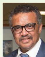
Dr. Tedros Adhanom Ghebreyesus WHO Director-General