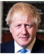
Boris Johnson British PM AAPS Association of American Physicians and Surgeons