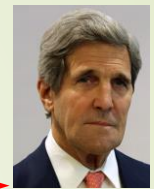
John Kerry Climate Czar