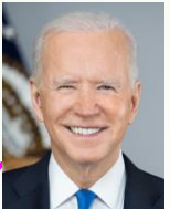
Joe Biden US President (?)