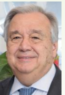
António Guterres UN Secretary General