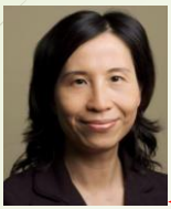
Dr. Teresa Tam Chief Public Health Officer