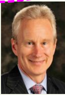
Dr. Peter McCullough Internist Cardiologist Epidemiologist AG AMERICAN GREATNESS