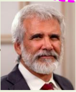
Dr. Robert Malone Inventor mRNA Vaccine