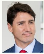
Justin Trudeau Canadian PM