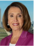
Nancy Pelosi Speaker of the House (?)