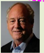
Dr. Patrick Moore Greenpeace Founder Ecologist