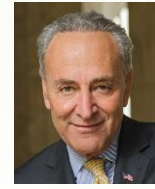
Chuck Schumer Senate Leader (?)