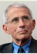
Dr. Tony Fauci Director NIH