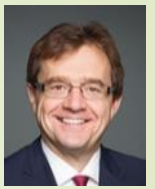
Johnathan Wilkinson Environment Minister